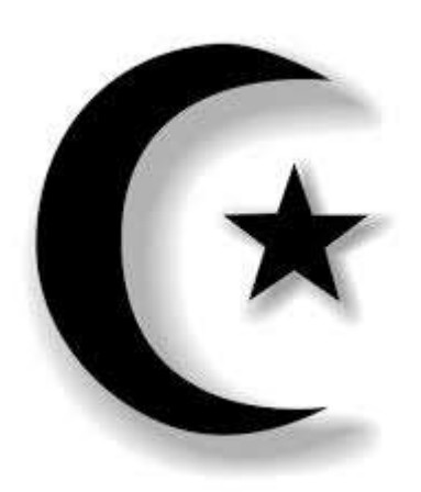
The crescent moon and star